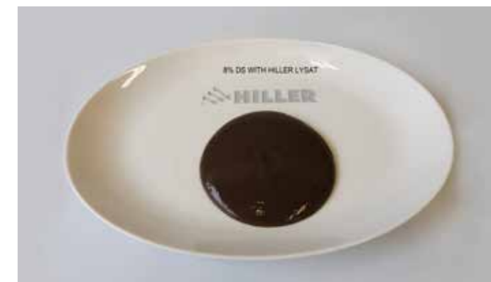
8 % DS with HILLER lysate