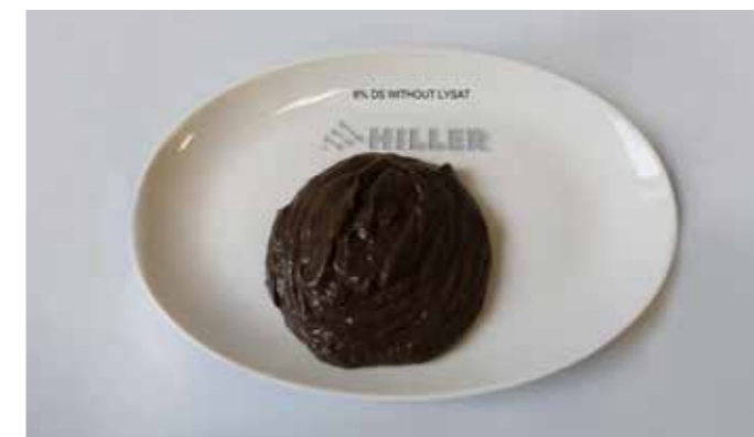
6 % DS without lysate