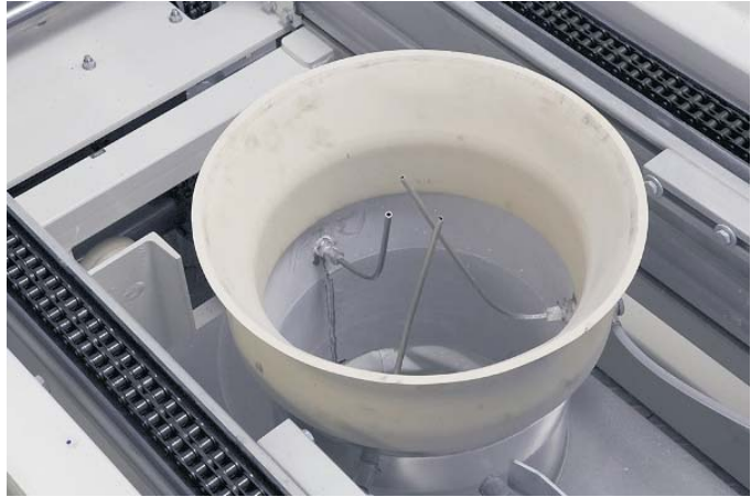
Patented docking collar with inflate device able