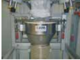
Big bag connecting system type BBA ___ A

The outlet of the big bag is tightened by lowering the connecting system.