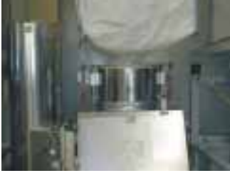
Big bag connecting system type BBA ___ F

After connecting the big bag, it is lifted a little by means of the hoist to tighten the outlet.