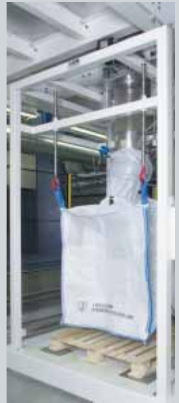
AZO also offers efficient solutions for filling big bags.

AZO GmbH + Co. KG D-74706 Osterburken Tel. +49 6291 92-0 Fax +49 6291 92-9500 info@azo.de, www.azo.de