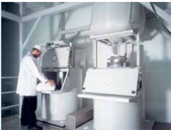
Hopper combined with big bag dumping system used in a bread factory