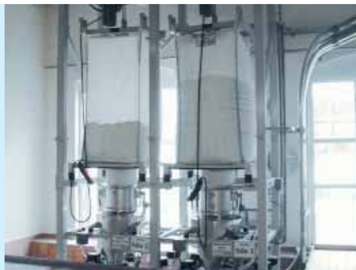
Big bag dumping station in a brewery used for storing kieselguhr which is required for filtering beer. These big bags also hold supplies in readiness. The transparent fabric makes the quantity of product in the bag easily visible.