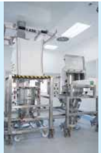
Pharmaceutical industry solution: big bag with forklift cross-bar - outlet tightened by means of lifting device