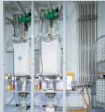
Big Bag dumping station with integrated lifting device for positioning big bags for baking mixes. After discharge, the products pass through rotary valves to the pneumatic conveying systems. Via a manual coupling station it is possible to feed different indoor silos.