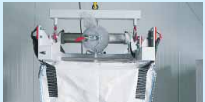
Big bag lifting equipment with an integrated device to roll up the inlet for use with highly sensitive products