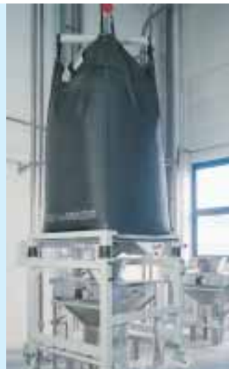
Discharging granular bulk material into collecting hopper without a big bag docking system, as no dust is created.