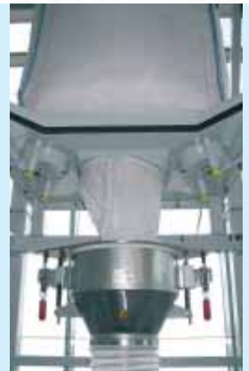
Big bag dumping station with massage device. A vibrator can also be used as an alternative.