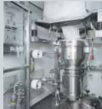
Big Bag dumping station for discharging pharmaceutical products into a buffer hopper