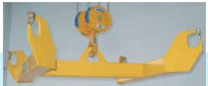
Standard cross bar with locking system