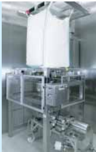
Big bag dumping station for pharmaceutical products with downstream safety screening