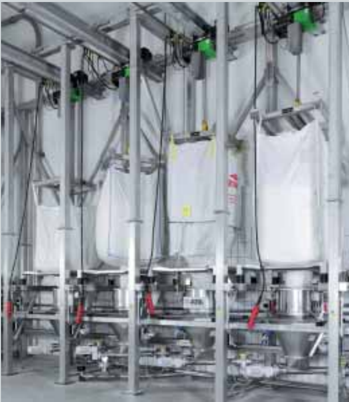
Big bag dumping station with buffer container and downstream dosing in pneumatic conveying systems.

raw materials into the production process can be integrated into the big bag handling systems. There is no limit to their flexibility.