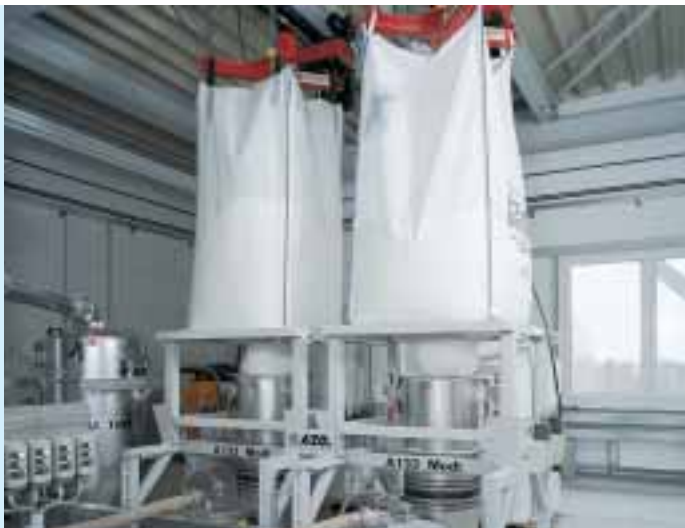
Big bags with 2,000 litre capacity and fixed docking systems i.e. the tension to allow complete discharge is achieved by the lifting device. The big bag is raised just before it empties completely, creating a funnel shaped cone.

Our big bag dumping systems are constantly being developed. We are currently working on contamination-free docking and connection systems which prevent any dust escaping.