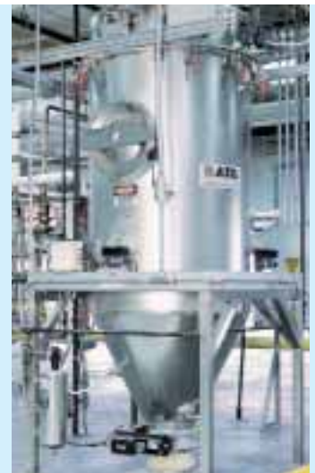
The upstream scales allow big bags to be weighed and changed in parallel, thus saving time