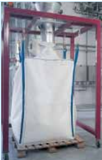
Pneumatic filling without weighing

As a reliable partner for raw material and process automation, we offer a range of solutions for filling big bags. These solutions are distinguished by their high level of reliability and operator-friendliness.