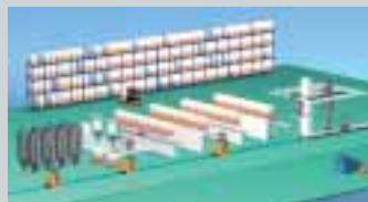
DosiLogistic® with automatic guided vehicles

and flexibly applicable components of the DosiBox® system allow fully individual automation concepts - from an automatic minor component dosing unit up to fully automatic logistics for minor components.