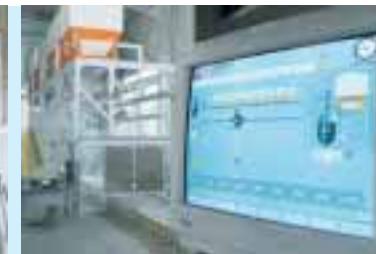
Production transparency and reliability