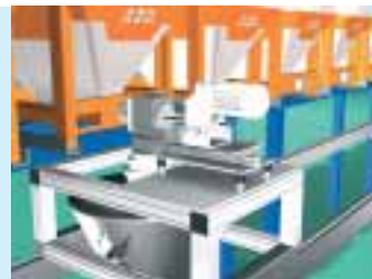
Safe and highly accurate unloading