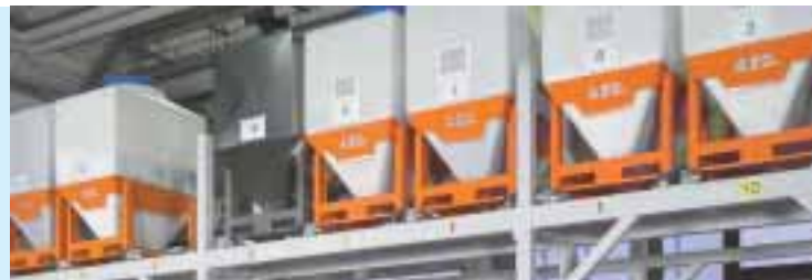
DosiBox®es at dosing sites