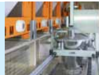
DosiDock® in action