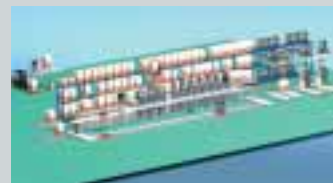
DosiLogistic® with moveable floor scales

AZO GmbH + Co. KG D-74706 Osterburken Tel. +49 6291 92-0 Fax +49 6291 92-9500 info@azo.de, www.azo.de