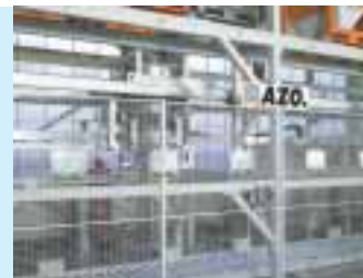
DosiDock® with moveable scales