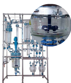
GLASS REACTORS / TECHNICAL GLASS