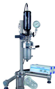
HIGH PRESSURE REACTORS IN METAL