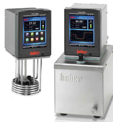
BATH AND CIRCULATION THERMOSTATS